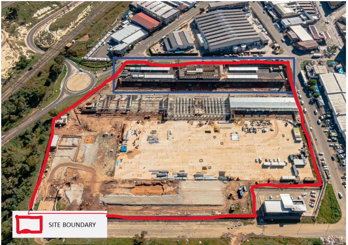
Figure 1- Selby depot footprint