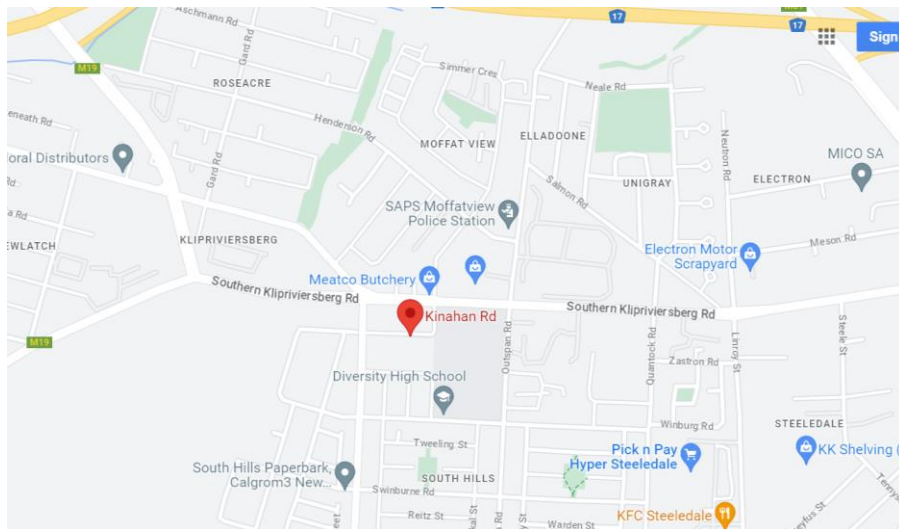
Figure 1: Moffat view Map

The location of proposed South Hills Clinic is erven 270 and 271 in Moffat View Extension 6, along Kinahan Road and Theunissen Street.