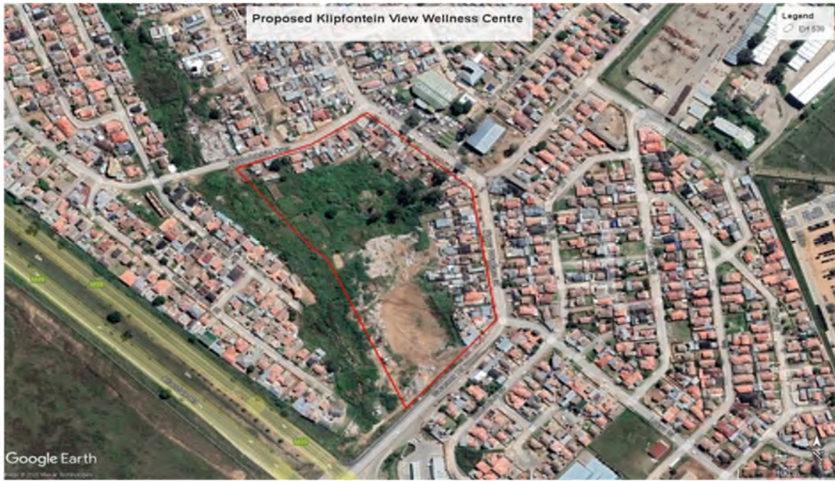
Image: Arial View of Site

The site is located on the corner of Ndamase Street and Saraseen road, Klipfontein