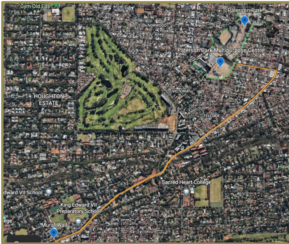
Figure 1: Map indicating Louis Botha Pedestrian Spine (Mural Wall including 9 th street)