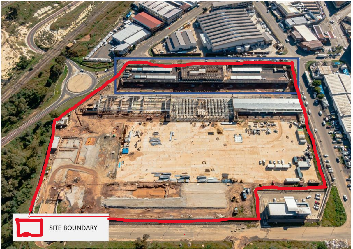
Figure 1- Selby depot footprint