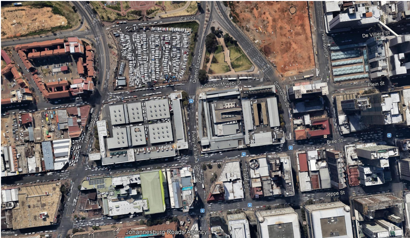
Figure 4: Metro Mall