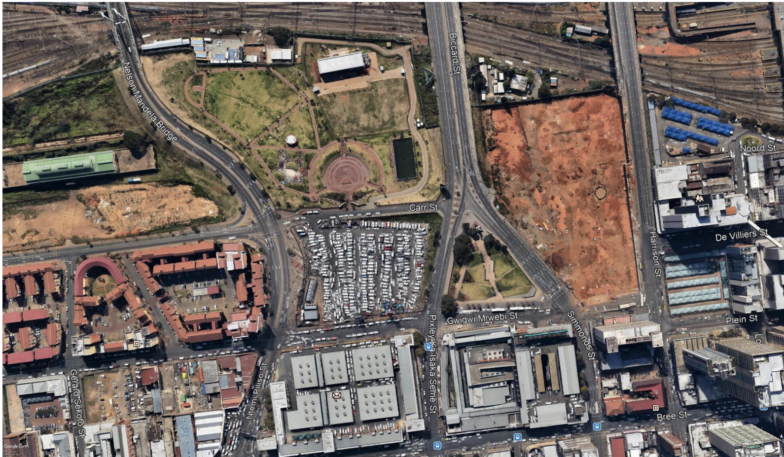
Figure 1: Carr Street Taxi Ranks