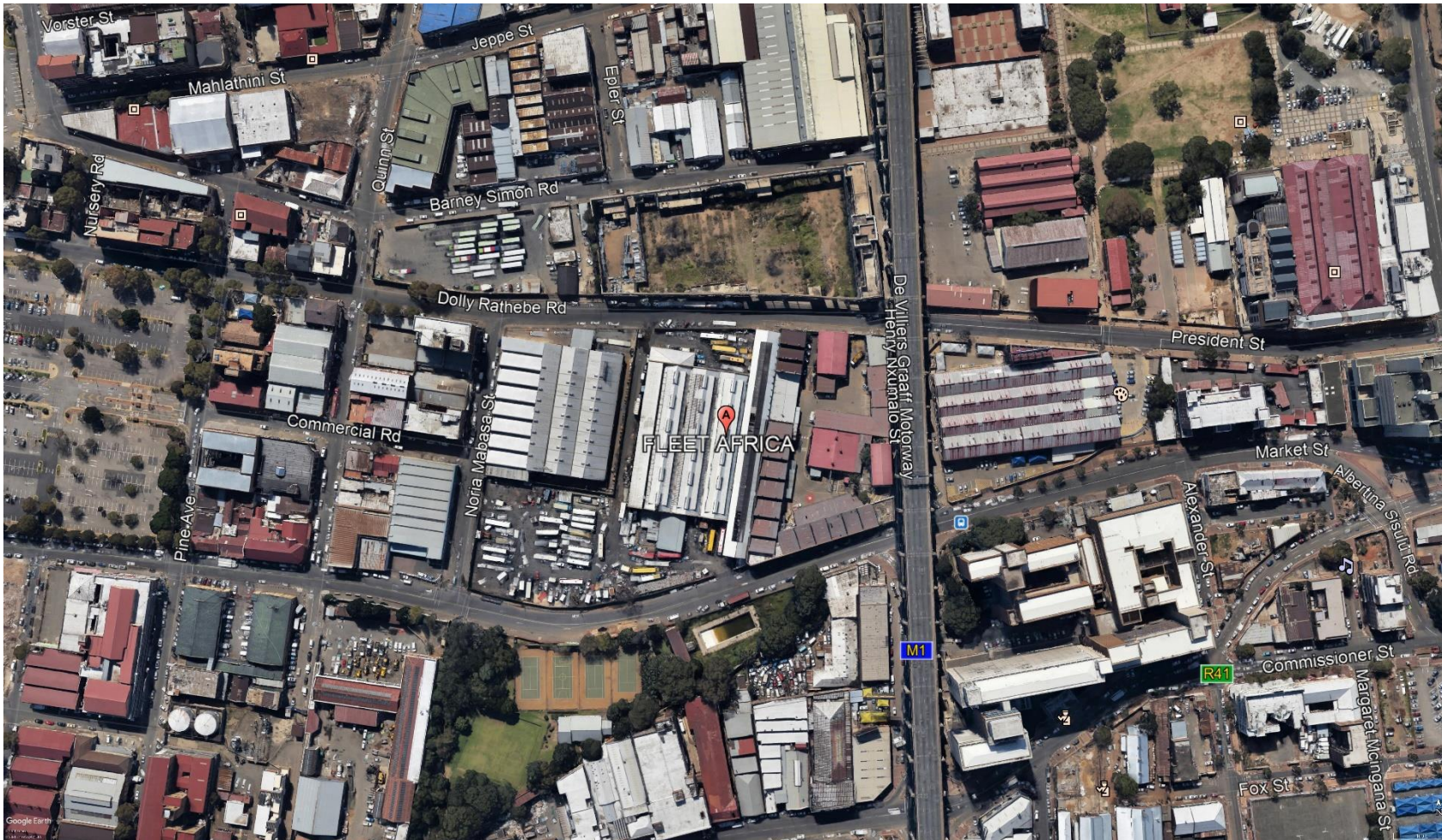
Figure 3: Fleet Africa PTF