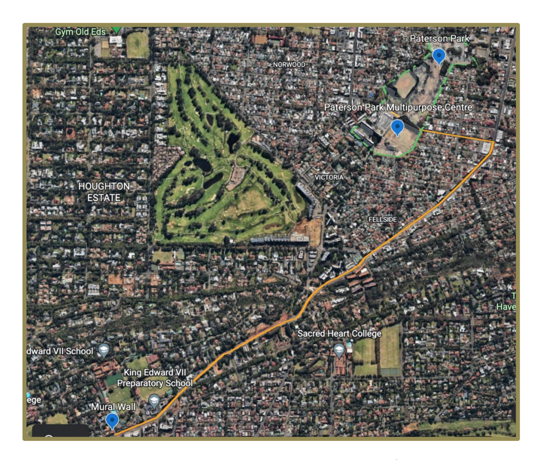
Figure 1: Map indicating Louis Botha Pedestrian Spine (Mural Wall including 9th street)